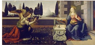
Advent Lessons and Carols December 4, 2022 4:00 p.m.

Next Sunday, December 4 at 4:00 p.m. , Epiphany’s musicians will lead this annual service, which begins with the story of the fall of humanity, concludes with the