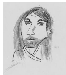
The Face of Jesus J, age 9

D, age 6: "There are two types of mystery, the ones we solve and the ones we don't -- like when someone dies"