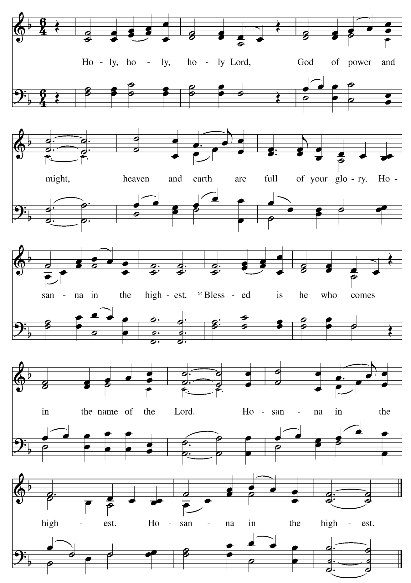
The Presider continues.