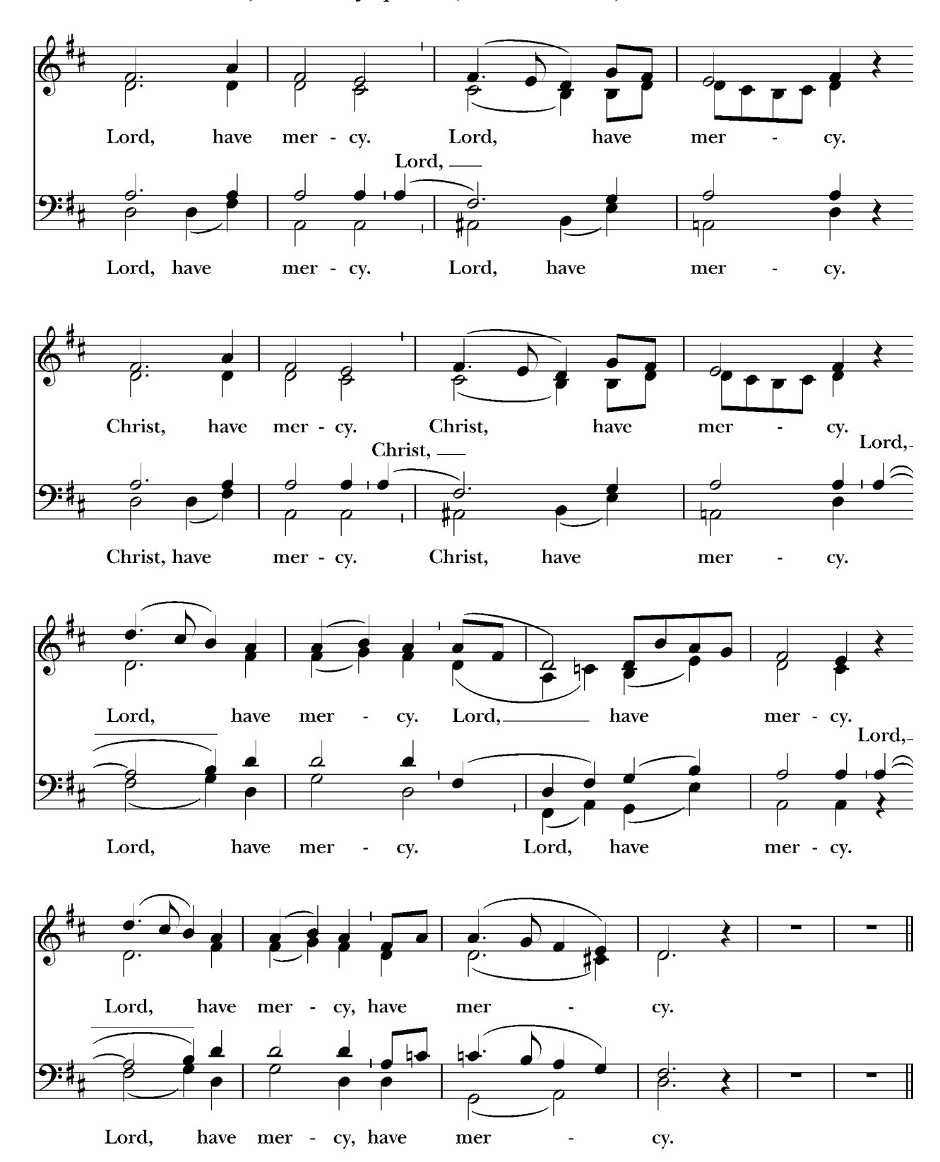
SONG OF PRAISE S 96 Lord, have mercy upon us (Schubert/Proulx)